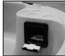
B. Pull weir door open.