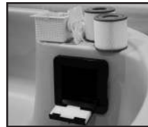
D. Remove the two separate filters and follow cleaning instructions above.