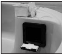
C. Remove basket.