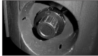
Drain* for V300/V500

* To drain the spa, make sure the gate valve is in the Up / Open position. Remove the cap from the drain and attach the garden hose. Open the valve by turning the large part of the drain counterclockwise until it stops. Pull on the drain that the hose is connected to until you hear it "pop". Water will gravity drain through the garden hose. Be sure to close the drain prior to refilling. Note: the drain will not remove all of the water in the spa. You may have to remove a small amount of water by hand.