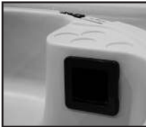
A. Locate skimmer.

The filter must be cleaned every 2 months, more often with heavy use, to get rid of objects and particles that are lodged in the filter pleats. Using a garden hose with a pressurized nozzle, push water from the inside to the outside of the filter pleats forcing all trapped particles out. If the filter is too dirty to be cleaned as described above, obtain filter cleaner material from your Viking Spa Retailer. Soak the filter overnight; then hose it down.