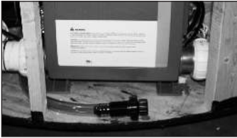
Drain* for V100

* To drain the spa, make sure the gate valve is in the Up / Open position. Remove the cap from the drain and attach the garden hose. Open the valve by turning the large part of the drain counterclockwise until it stops. Pull on the drain that the hose is connected to until you hear it "pop". Water will gravity drain through the garden hose. Be sure to close the drain prior to refilling. Note: the drain will not remove all of the water in the spa. You may have to remove a small amount of water by hand.